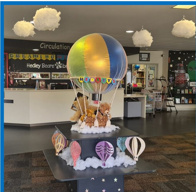
Hedley's Dream Adventure

We have included some photos of the displays that have been completed over two pages in this newsletter and we will post a video on our Facebook page to give you all a close up view of what they look like and the detail involved.